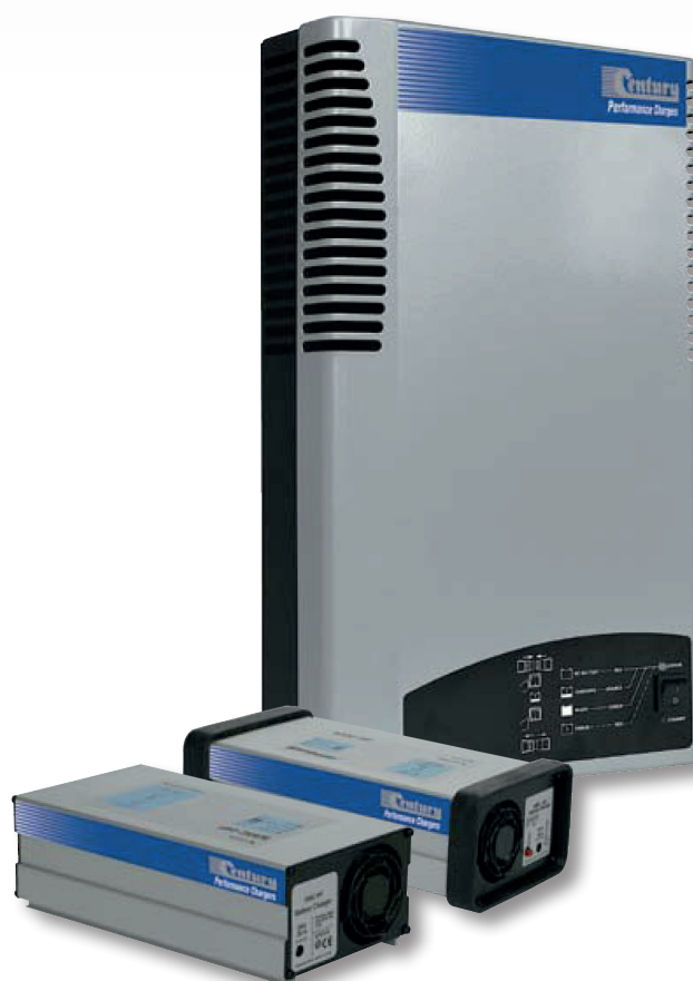
Left & middle: 24V 30A, 45A, 60A Right: 24V120A, all 36V, 48V & 80V