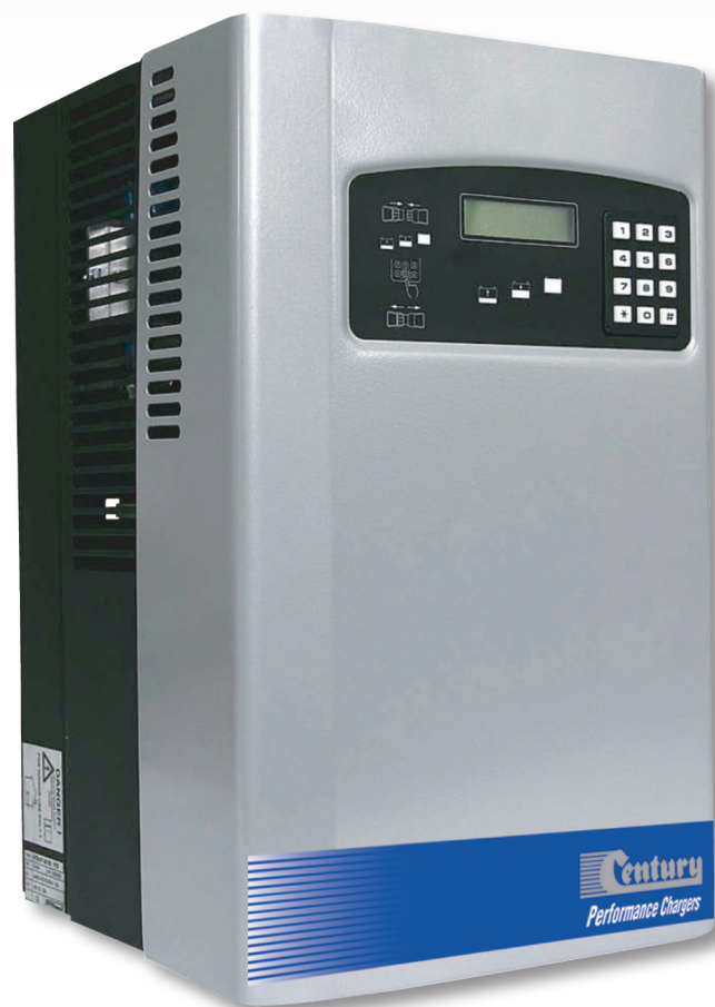
Product shown above: MTM-HF 48V 130A

The use of high frequency power conversion has the effect of reducing the amount of energy consumed for charging, and providing a greater level of control of the power output. This technology also has the advantage of being lighter weight to conventional thyristor controlled chargers. This allows operators to have the option of wall mounting these chargers, reducing the possible risk of impact from other equipment, and improving the use of space.