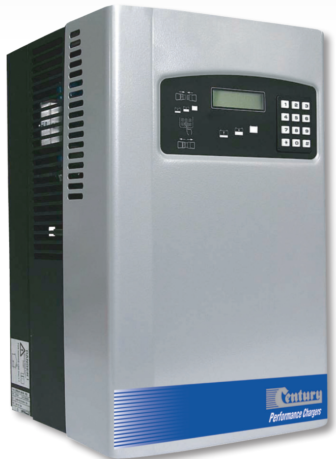
Product shown above: MTM-HF 48V 130A